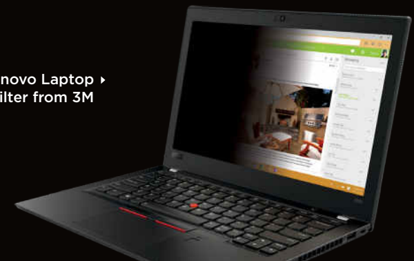
Lenovo Laptop ▶ Privacy Filter from 3M