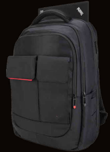
ThinkPad Professional ▶ Backpack