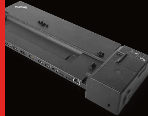
◀ ThinkPad Ultra Dock